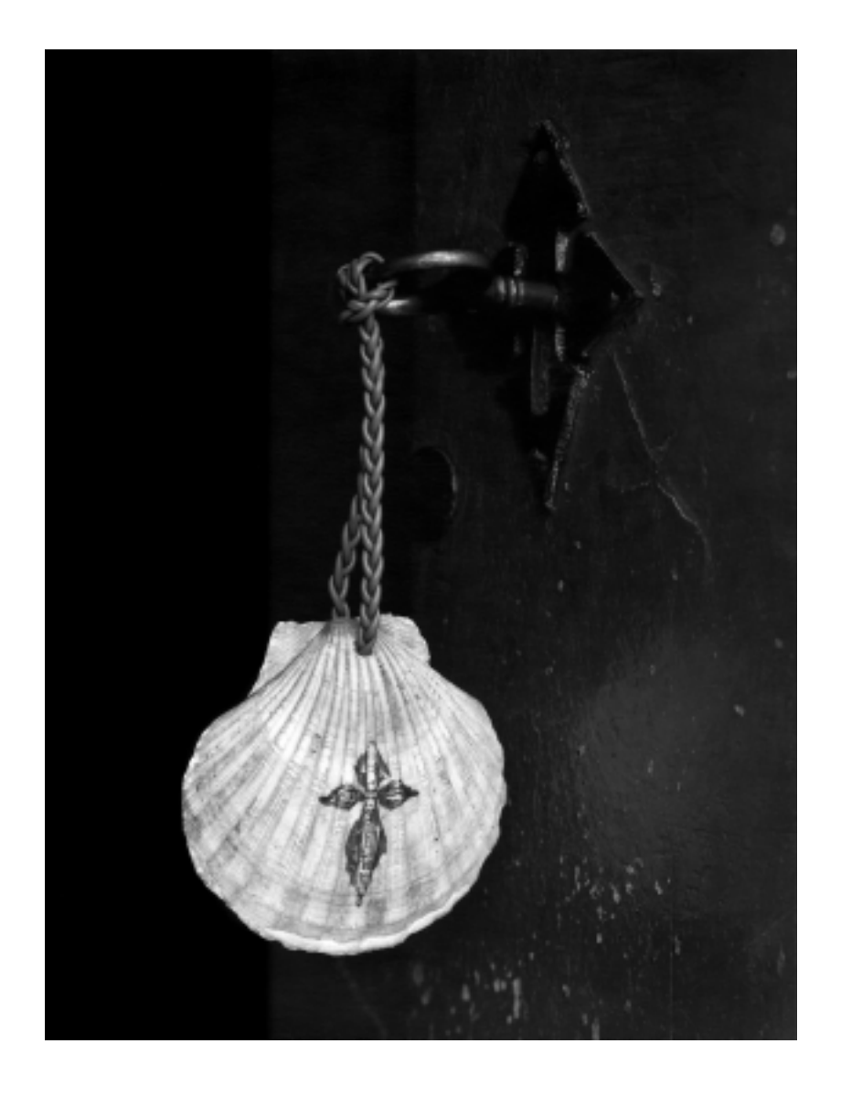
The scallop shell and the red dagger cross are traditional symbols of the Santiago pilgrimage. This key opens the door to the Church of St. James in Villafranca del Bierzo, Spain.