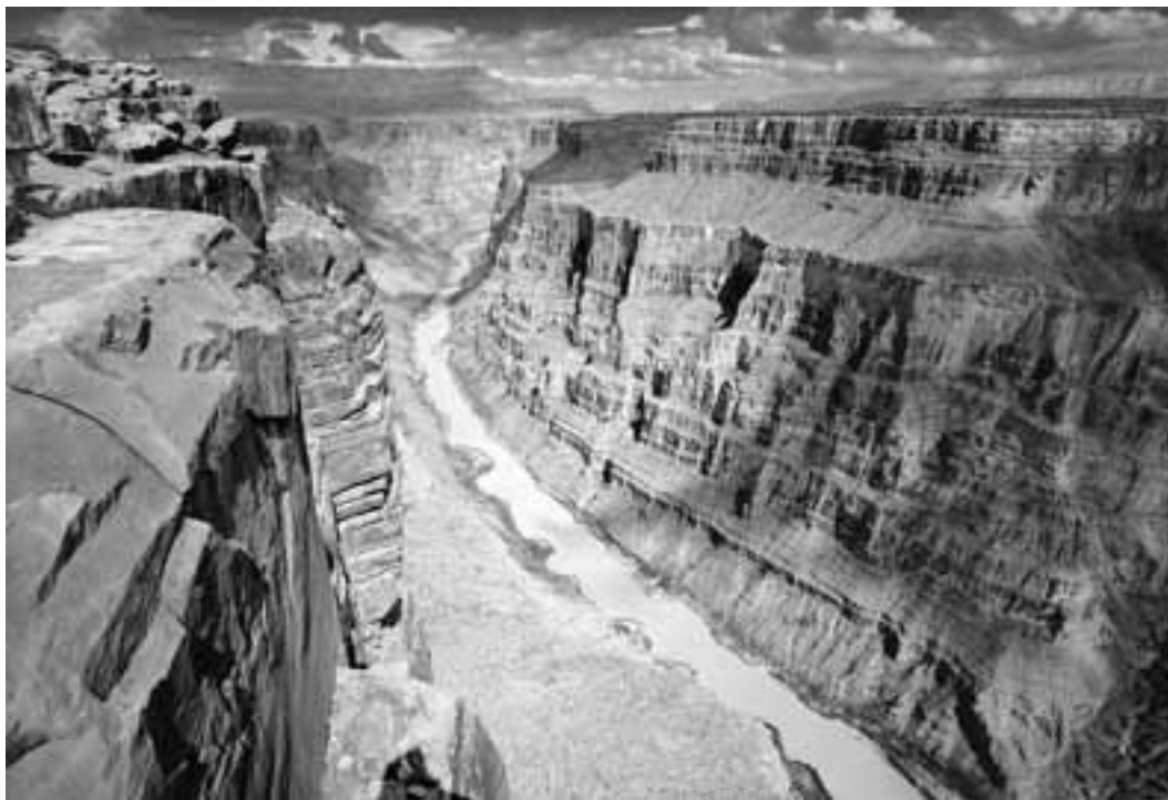
Toroweap Overlook, The Grand Canyon, AZ, 1982