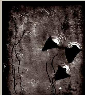
Bullock in LensWork #55 Rare and Unknown Bullock