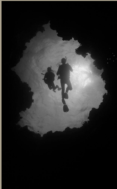
Looking up into Skylight

London-based online magazine, The Bod Edit , published a very good article/interview of my work and thoughts about the Ocean. Read the article here.