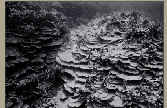
Healthy and Bleached Plate Coral, Honaunau