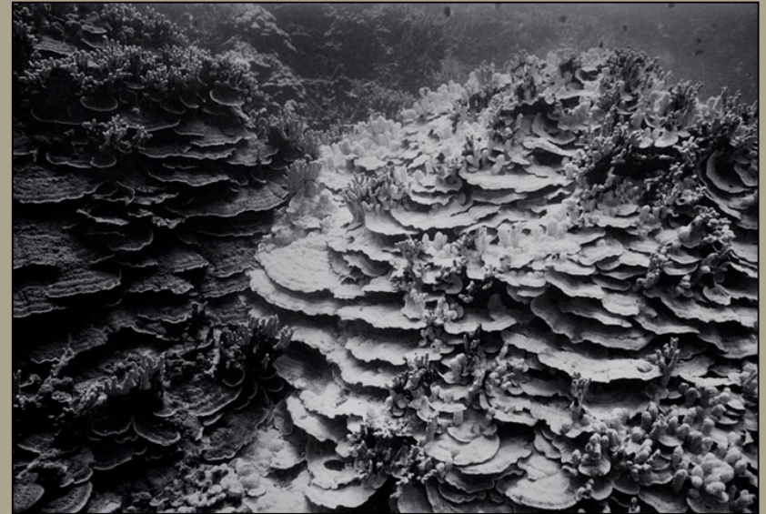
Healthy and Bleached Plate Coral, Honaunau

The living sea is a thing of beauty, but beneath the surface human activity and pollution has put its very survival in jeopardy. Three Kona artists make a statement about the threat beneath the surface.