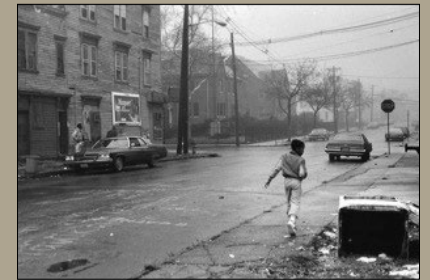
Child Walking Away in the Fog, Newark

Her recently published book by Temple University Press, Risking Life and Lens: A Photographic Memoir will be on sale at the ICP gallery bookstore in their Bowery gallery.