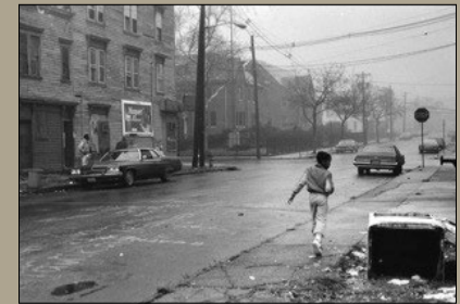
Child Walking Away in the Fog, Newark

Her recently published book by Temple University Press, Risking Life and Lens: A Photographic Memoir will be on sale at the ICP gallery bookstore in their Bowery gallery.