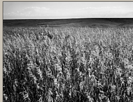
Kirby in LensWork #33 Wheatcountry

All camera formats, film, digital, and all printing approaches are welcome.