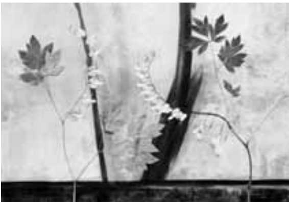
9¾x14" gelatin silver LWS145 Bleeding Hearts , 1992

Print only price $99* plus shipping & handling