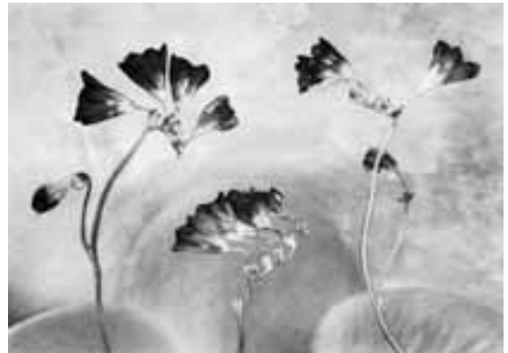
10x14" gelatin silver LWS143 Freesias , 1991